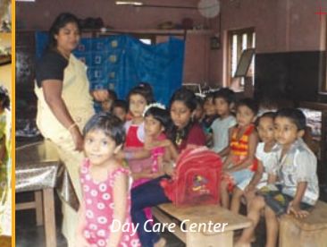
Day Care Center