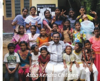
Asha Kendra Children

View more photos of our projects seedsindia.net/media