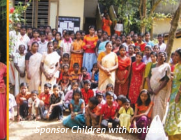
Sponsor Children with moth