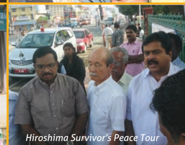
Hiroshima Survivor's Peace Tour